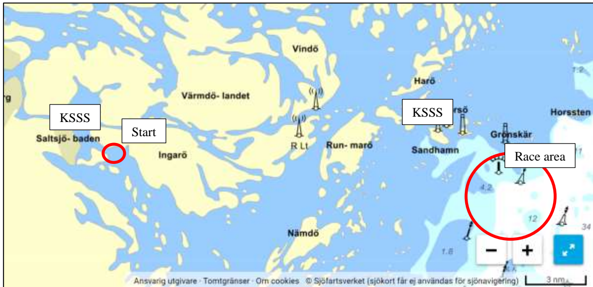
Course area on 5-6 th of August