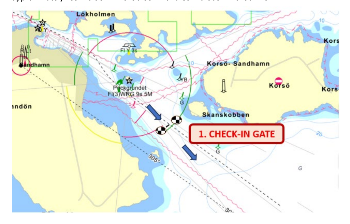
approximately 59°16.937'N 18°56.357'E and 59°16.863'N 18°56.149'E